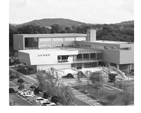
Education Research Institute